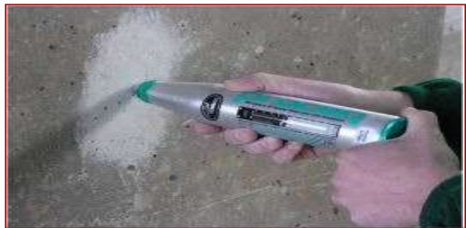
Figure-1 - Rebound Hammer Testing

The rebound hammer (such as the Schmidt Hammer) is Consist of a spring control hammer that slides on a plunger within a tubular housing. When the plunger is pressed against the surface of the concrete, the mass rebound from the plunger. It reacts against the force of spring. The Distance travelled by the mass, is called rebound number. The Schmidt rebound hammer is basically a surface hardness tester & testing as per IS: 13311 (Part 2): 1992 & BS 1881: Part 202: 1986, the rebound of an elastic mass depends on the hardness of the surface against which mass strikes. Figure-1 shows the example Rebound Hammer Testing.