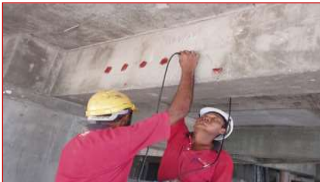
Figure-2 Ultra Pulse Velocity Testing

The UPV method involves measuring the speed of travel of an ultrasonic pulse through concrete. This speed is influenced by the density and elastic modulus of the concrete. It is often used for relative strength assessments. The technique is most effective and economic for comparative assessments of quality (density) and detection of voids, delamination and under compacted and honeycombed areas because the pulse takes longer to travel around defective areas.