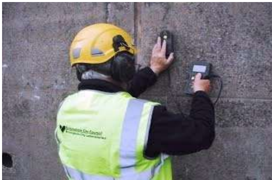
Fig.-4- Bar Locator and Cover Depth Meter

The cover meter technique is the least complicated and least expensive of all the NDT techniques. This test is used to assess the location and diameter of reinforcement bars and concrete cover. Principle: based on the measurement of change in electromagnetic field caused by steel embedded in the concrete. Equipment: Photometers comprise a search head, meter and interconnecting cable. The concrete surface is scanned, with the search head kept in contact with it while the meter indicates, by analogue or digital means, the proximity of reinforcement.