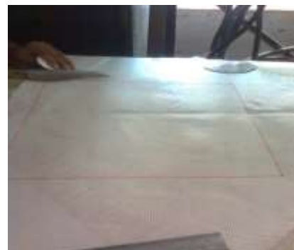
(Fig.5.a) Glass fiber

To meet the wide range of needs which may be required in fabricating composites, the industry has evolved over a dozen separate manufacturing processes as well as a number of hybrid processes. Each of these processes offers advantages and specific benefits which may apply to the fabricating of composites. Hand lay-up and spray-up are two basic moulding processes. The hand lay-up process is the oldest, simplest, and most labour intense fabrication method. The process is most common in FRP marine construction. In hand lay-up method liquid resin is placed along with reinforcement (woven glass fiber) against finished surface of an open mould. Chemical reactions in the resin harden the material to a strong, light weight product. The resin serves as the matrix for the reinforcing glass fibers, much as concrete acts as the matrix for steel reinforcing rods. The percentage of fiber and matrix was 50:50 in weight.