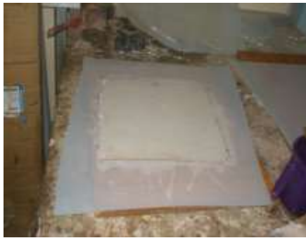
(fig. 5.b) Plate casting

Contact moulding in an open mould by hand lay-up was used to combine plies of WR in the prescribed sequence. A flat plywood rigid platform was selected. A plastic sheet was kept on the plywood platform and a thin film of polyvinyl alcohol was applied as a releasing agent by use of spray gun. Laminating starts with the application of a gel coat (epoxy and hardener) deposited on the mould by brush, whose main purpose was to provide a smooth external surface and to protect the fibers from direct exposure to the environment.