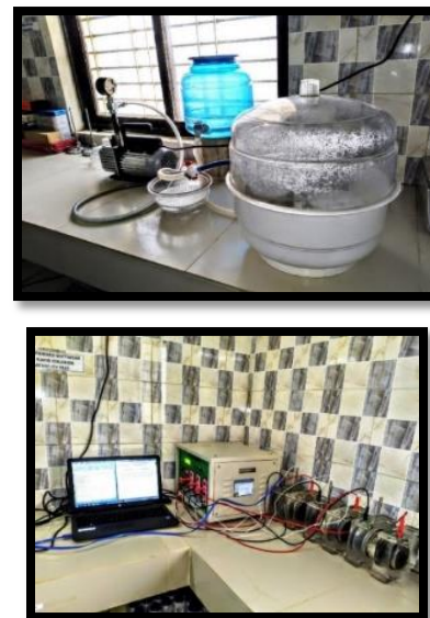
Figure-2: RCPT test of concrete as per ASTM C1202

voltage for 6 hours using the apparatus and the cell arrangement as shown in Figure-2. In one reservoir is a 3.0 % NaCl solution and in the other reservoir 0.3 M NaOH solution is used. The total charge passed is determined and this is used to rate the concrete as per Table-I & resistivity of chloride ions penetrability in concrete.